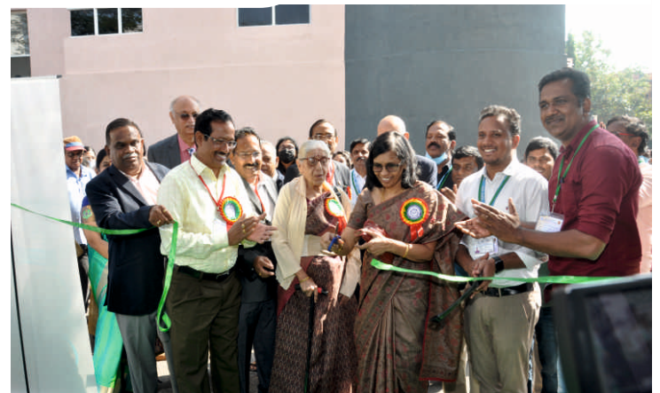
Inauguration of Stalls & Poster Session