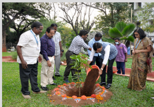
Dr. Mansukh Mandaviya Hon'ble Minister of Health and Family Welfare and Chemicals & Fertilizers planted sapling in the campus of NIN as a mark of his visit to the Institute.