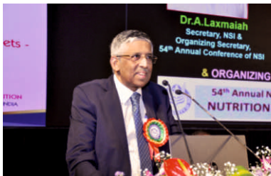
Keynote address by Dr. V. Mohan

54 th Annual Conference of Nutrition Society of India (NSI) held from 22-23 December with 1200+ delegates, 200+ volunteers, 2 symposia, debate, 3 orations, 2 young scientist sessions, 360+ posters & 50+ paper presentations.