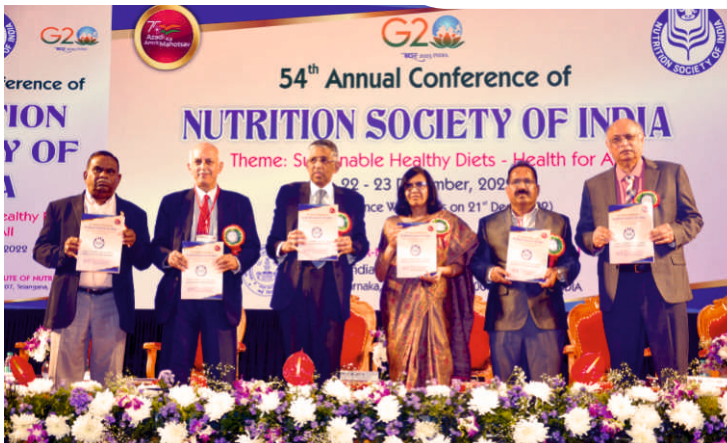
Release of Souvenir Book