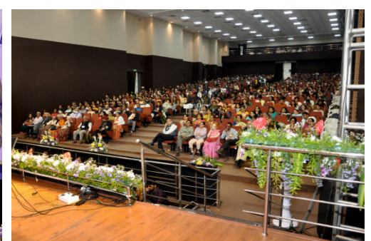
A volume of audience