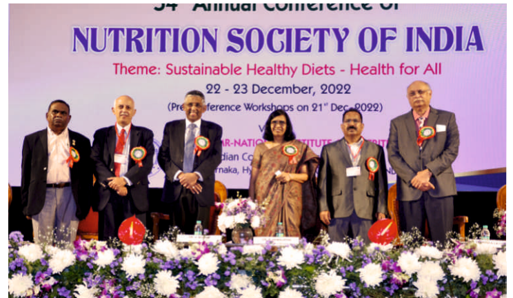
Dignitaries on the Dias